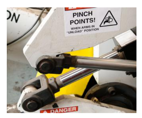
Safety and Facility ID