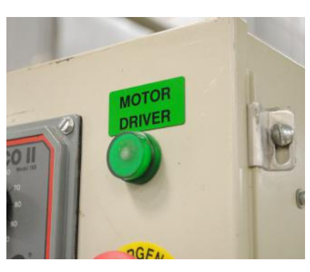
Raised Panel Labels